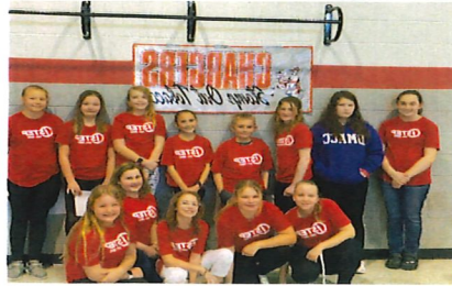
Chariton 6 th graders