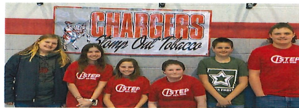
Chariton 7 th graders