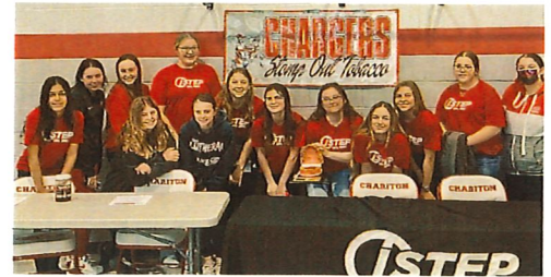
Chariton 8 th graders